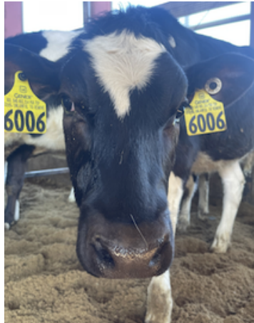
Gender: Heifer (Female)