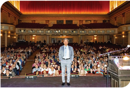
Above: David Baldacci with attendees at The Appell Center.

In 2025, York County Libraries launched two signature fundraisers, following a strategic planning process which identified the need to strengthen long-term financial sustainability. We are proud to share the results of these initiatives!