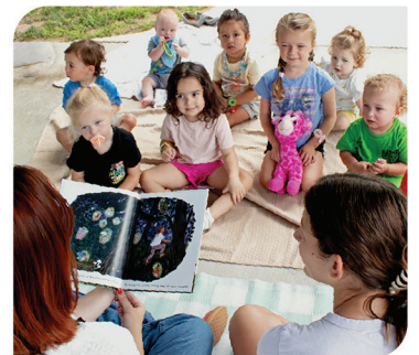
Outdoor Story Time at Springettsbury Township Park

Story Time sessions increase attention span, early group experiences, and opportunities for children and caregivers to bond. 1,196 story sessions reached 33,391 children in 2025!