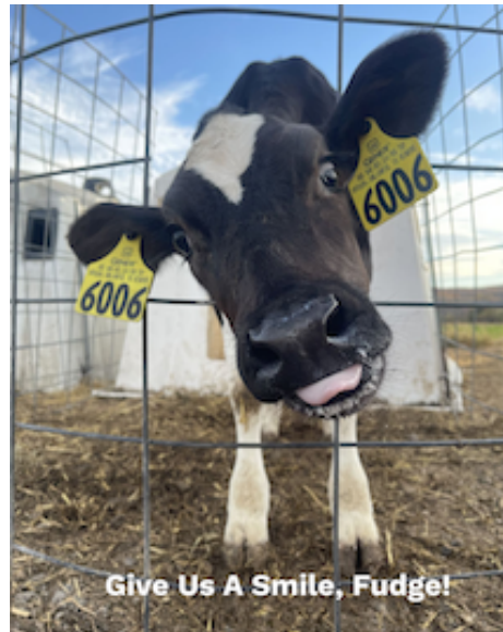
Give Us A Smile, Fudge!

Birthday: September 16, 2025 2 Mo. Weight 182 lbs. Gender: Heifer (Female)