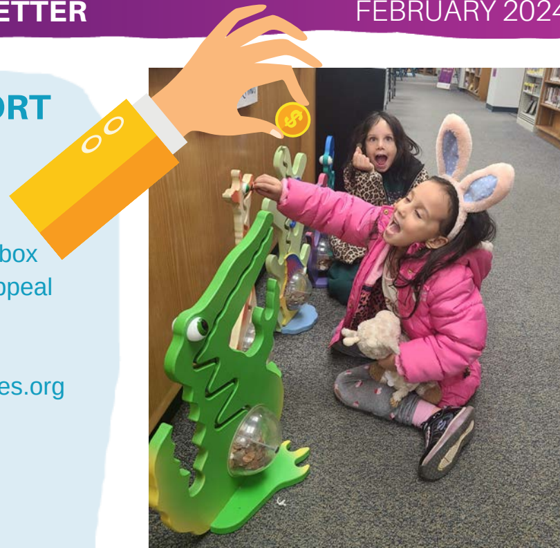
WE BUY NEW BOOKS WITH OUR GIRAFFE MONEY. THANKS KIDS!