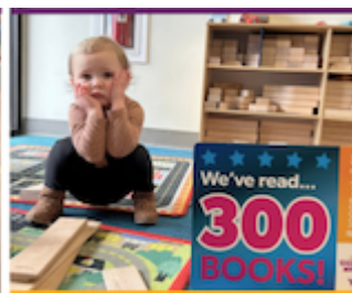
1,000 Books Before Kindergarten