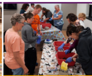
Green Thumb Garden Talks

Each visit to a York County library opens possibilities, cultivates curiosity, and brings our community together. People from across the county rely on their libraries for more than books. Our libraries are engaging and safe spaces for teens after school.