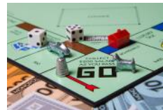
Table Top Game Night

Ride a roller coaster or save the world from zombie animals — without ever leaving the library! NO REGISTRATION REQUIRED